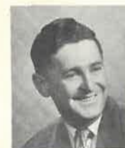
Charles McFail Construction

If you are interested, phone the Box Office, BR 2481.