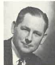
"Happy" Norris Lighting